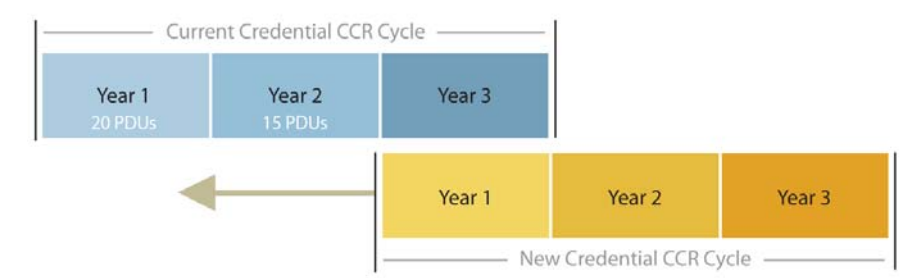
OPTION B: Align both CCR cycles to the date of your current credential.

Option B – The new credential will share the PDUs you already earned for your current credential and any that you earn moving forward. The renewal date for the new credential will be set equal to the existing renewal date for the credential you currently hold.