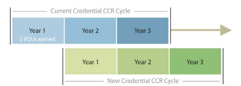
OPTION A: Align both CCR cycles to the date of your new credential.

Option A – the credential you already have – the "current" credential – and the "new" credential will share PDUs going forward. Any PDUs earned for your current credential before you obtained the new credential will be forfeited. The renewal date for your current credential will be set equal to the newly-acquired credential renewal date.